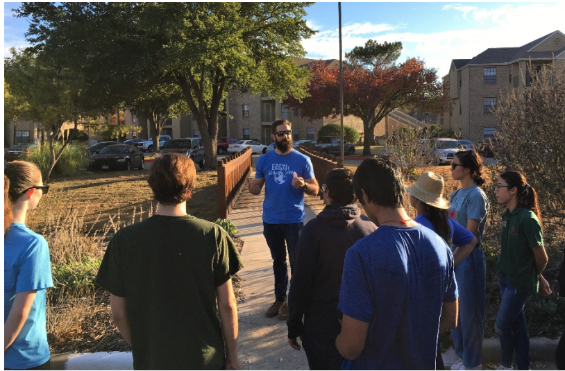
OSV Harvest Party