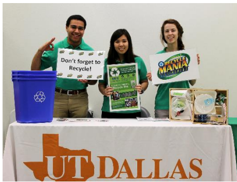
Figure 1 Eco Reps at Comet Basketball Game