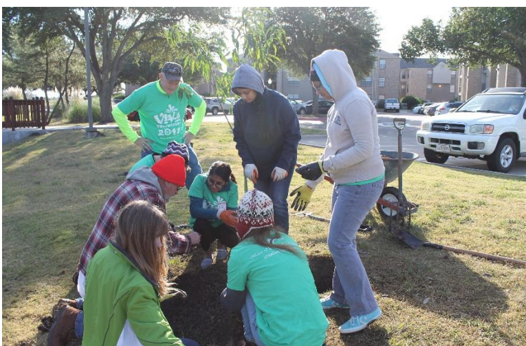
Figure 2 Student volunteers learning how to plant trees at the Community Garden during Viva Volunteer