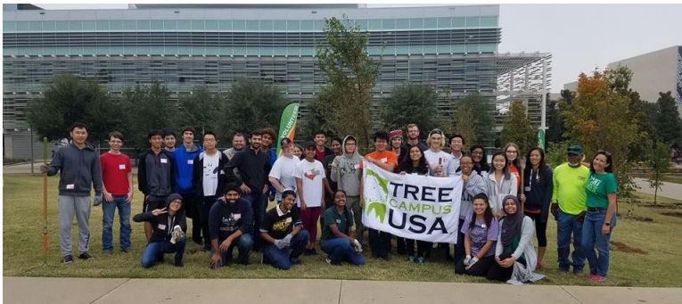
Figure 1 Texas Arbor Day Tree Planting